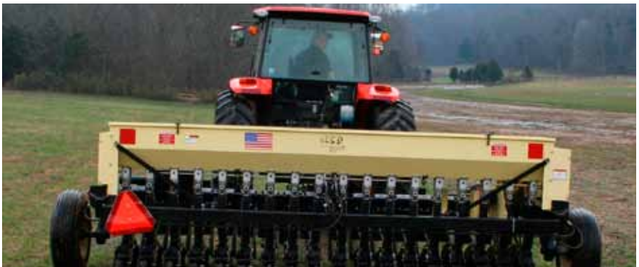
Drilling warm season grass seed using warm-season specialty drills.

Debearded seed with the chaff cleaned out can be run through a conventional drill or can be broadcast when special care is taken as will be explained later in this booklet. A possible exception to this is Little Bluestem and Side Oats Grama, which can rarely be debearded completely without damaging the seed. Mixes with minor percentages of debearded Little Bluestem should be okay to run in a conventional drill with careful monitoring. We recommend the use of specialty warm season no-till drills even for debearded seed due to other features normally included that aid in accurate seed placement. With the extremely low Farm Bill Program seeding rates it is critical that every seed possible be placed to maximize germination.