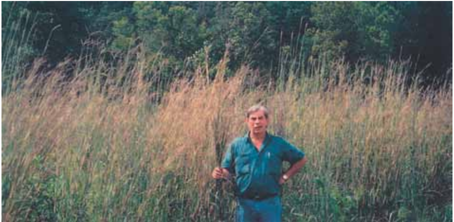
Using high quality cleaned and conditioned seed pays.