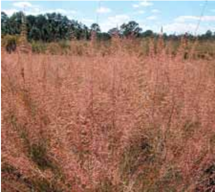
Pineywoods dropseed • Sporobolus junceus