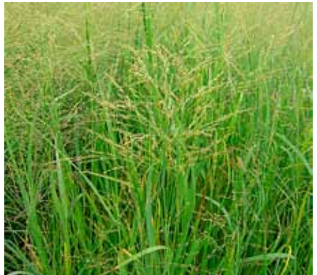
Switchgrass • Panicum virgatum