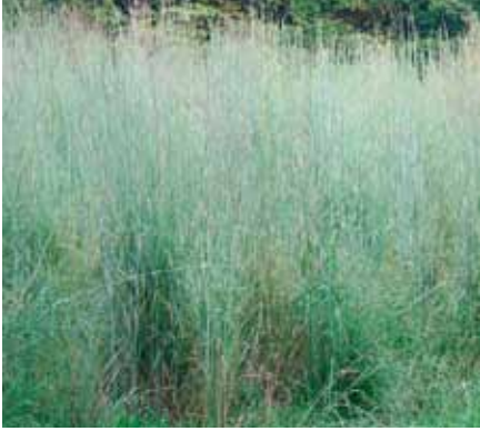
Big bluestem • Andropogon gerardii