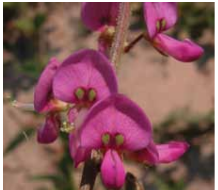
Florida tick trefoil • Desmodium floridanum