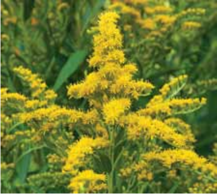
Rigid goldenrod • Solidago rigida