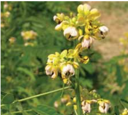
Wild senna • Cassia marilandica