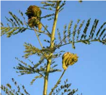
Illinois Bundleflower • Desmanthus illinoensis