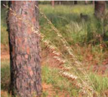
Lopsided indian grass • Sorghastrum secundum