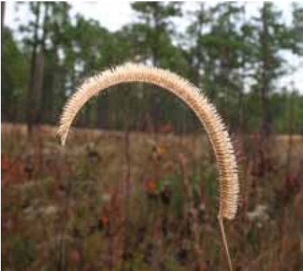
Toothache grass • Ctenium aromaticum