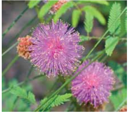
Sensitive briar • Mimosa quadrivalvis