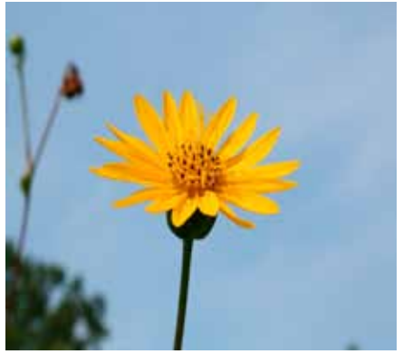
False sunflower • Heliopsis helianthoides