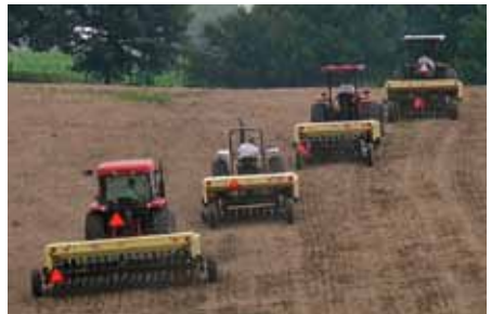
CRP Planting in a pasture field following effective competition control practices. Practices included bush-hogging in the fall, a spring burndown, and a pre-emergent Roundup® burndown with an Imazapic-based herbicide included to suppress warm season seed germination.