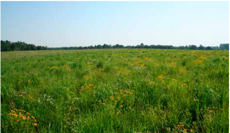
A wildlife habitat planting 12 months after seeding. This field was seeded on June 21 in a dry year.

The danger in planting late is the increased possibility of reduced soil moisture. Generally, the optimum time for seeding NWSG seed in the southeastern United States is mid-May to mid-June. In the Deep South, seeding may begin as early as March 15. Two weeks earlier is okay if you are absolutely certain there will be no warm season grass and weed competition. In normal to moderately below normal moisture years successful plantings have consistently been completed as late as the last week in June. At these later dates it is even more important to eliminate competition for soil moisture.