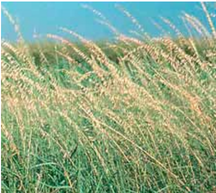
Sideoats grama • Bouteloua curtipendula