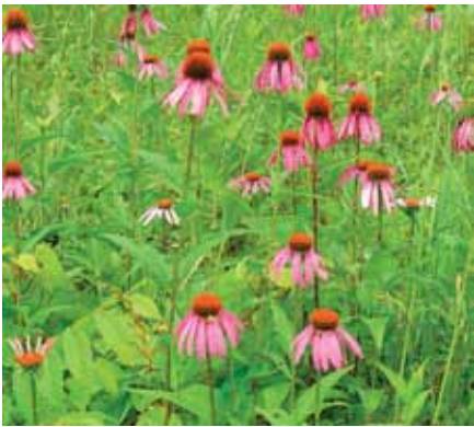
Purple coneflower • Echinacea purpurea