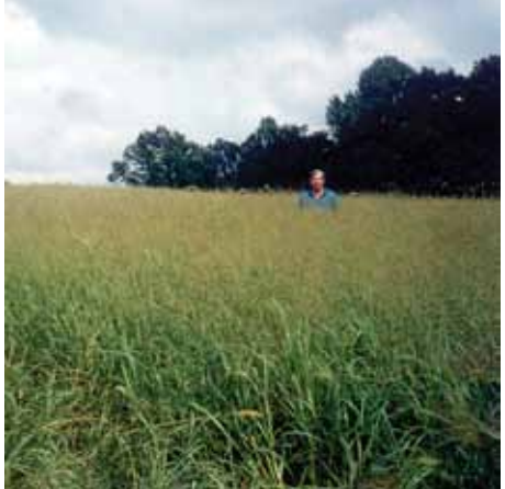
Forage planting at 90 days

Be patient - it takes much longer to establish a stand of NWSG than it takes to establish a stand of cool season grasses. What may look like a weed patch in the first growing season can be a good stand. If in doubt, ask your DC, a Fish & Wildlife Resources biologist, or your seed producer.