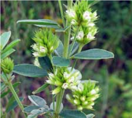
Roundheaded lespedeza • Lespedeza capitata