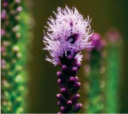
Spiked blazing star • Liatris spicata