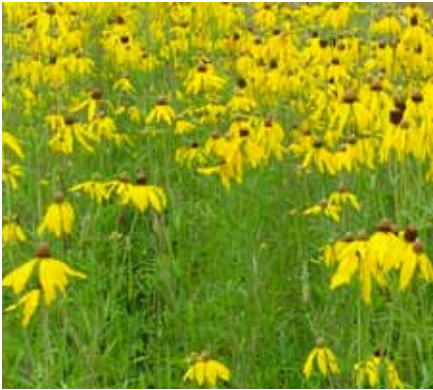
Greyheaded coneflower • Ratibida pinnata