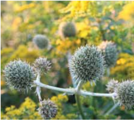
Rattlesnake master • Eryngium yuccifolium