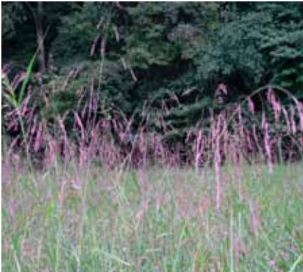
Purple top • Tridens flavus