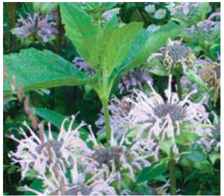
Bergamot • Monarda fistulosa