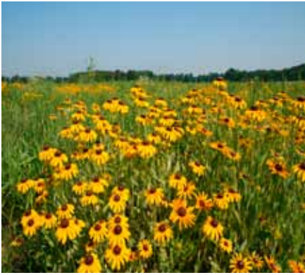
Blackeyed susan • Rudbeckia hirta