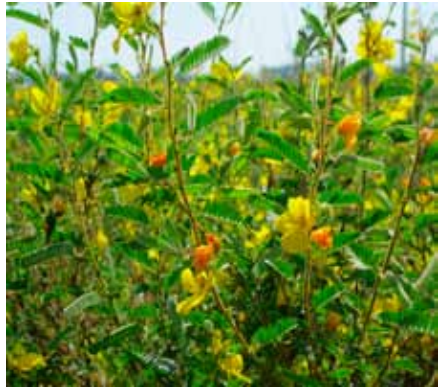
Partridge pea • Cassia fasciculata