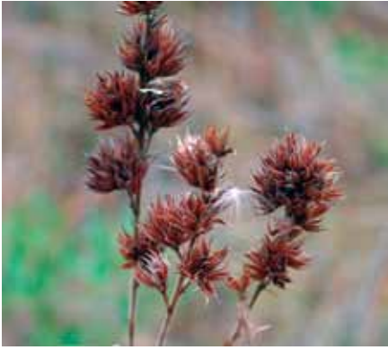
Hairy lespedeza • Lespedeza hirta