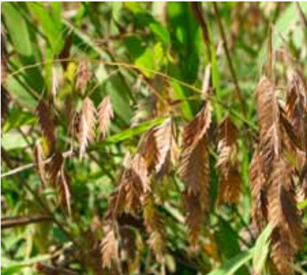
River Oats • Uniola latifolia