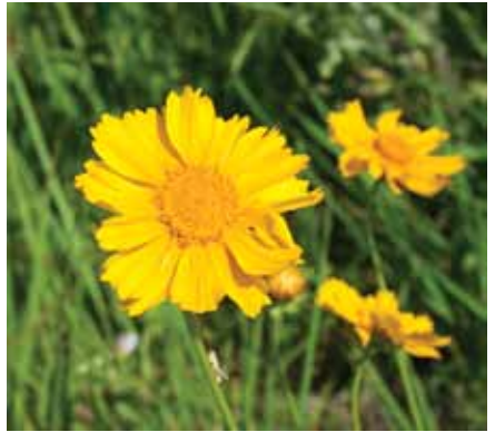
Lance leaved coreopsis • Coreopsis lanceolata