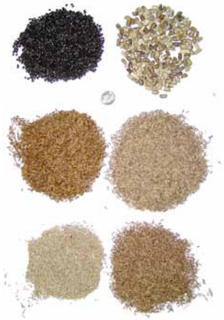
Quality seed is free of chaff and weed seed, and has a current seed test showing Purity and Germination.

Seed shipped out directly to consumers evades any quality inspection by state regulatory services or any other agency designated to protect consumer interests. Such practices create a dumping ground for old, mislabeled, and poor quality seed. Seed industry analysts are reporting that low demand over the past few years has resulted in large inventories of old seed stored in bins without heat and moisture control.