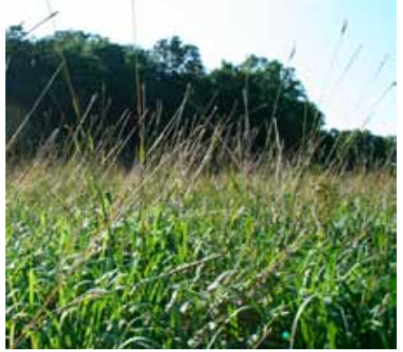
Eastern gamma grass • Tripsacum dactyloides