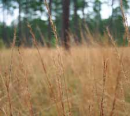
Wiregrass • Aristida stricta