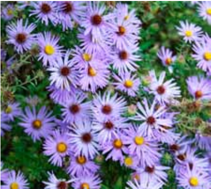
New England Aster • Aster novae-angliae