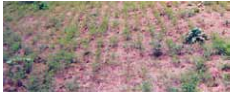
CRP planting at 45 days