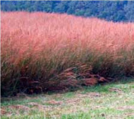
Indian grass • Sorghastrum nutans