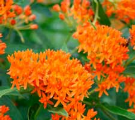
Butterfly milkweed • Asclepias tuberosa