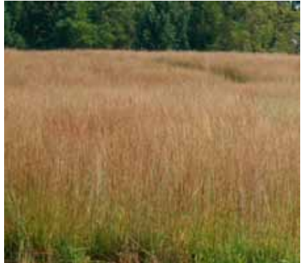
Little bluestem • Schizachyrium scoparius